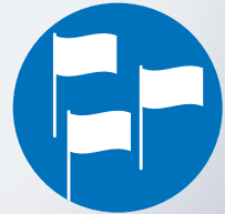
Exhibit alongside 1,200 companies and 25 national groups

No. 1 sourcing platform for all those involved in healthcare