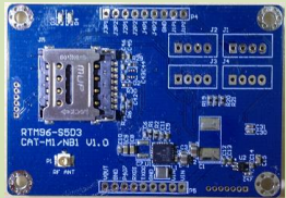
RTM96 CATM1/NB1 modem board