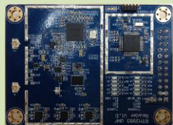
RTM3993 UHF RFID reader modem board