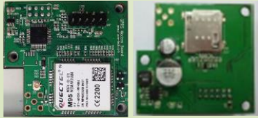
RTGM0x series universal GPRS modem board