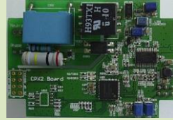
CPXx series G3 PLC Modem Board