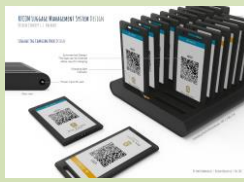
LMS Luggage Tag & Docking Station